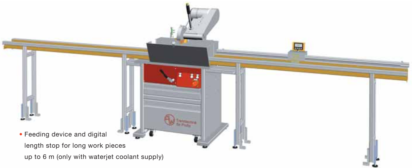
• Feeding device and digital length stop for long work pieces up to 6 m (only with waterjet coolant supply)