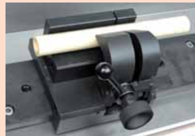
• Quick clamping system for various clamping devices