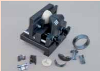
• Clamping device with 2 jaws, especially adapted for round parts