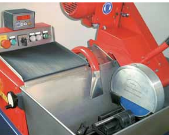
UFT 210 – the machine for cutting-off and facing

The UFT 210 is an adaption allowing both cutting off and facing in one single operation. The axial displacement of 40 mm and the digital display make this machine ideal for the grinding of punches and pins, cutting dies and ejector pins in the tool and die industry.