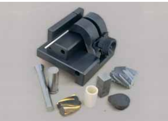
Three point clamping device for 3 – 50 mm

When using the UFT 370 , the work piece is always completely immersed which allows a maximum cooling of the grinding point through the disc rotation. Therefore the work piece and the disc have an optimal cooling and cleaning.