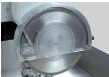
• Waterjet coolant supply built into the disc protection