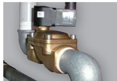
• Connection to central or separate coolant supply systems

You will find more choices and information on our accessory program under www.anton-wimmer.de