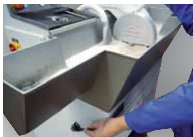
• Bigger immersion vats on request