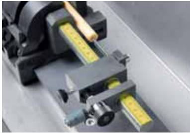
• Length stop with precision set-up

A selection of our many available options