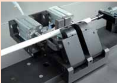
• Clamping devices with manual or pneumatic clamping