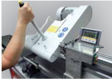
• Length stop with digital display