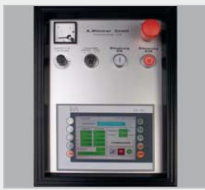
Graphic display with touch screen