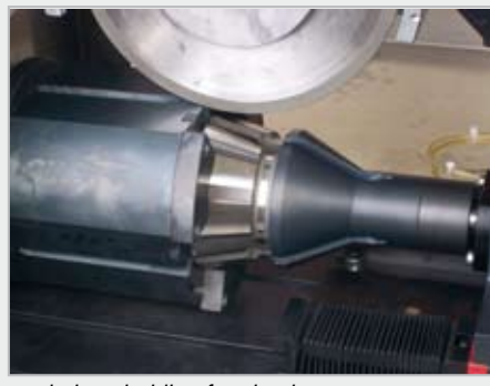
workpiece holding for chucks

This gantry-type cut-off machine is ideal for rapidly and precisely cutting-off or indenting big workpieces in hard or abrasive materials. Typical applications are for instance the production of honing stones or chucks.