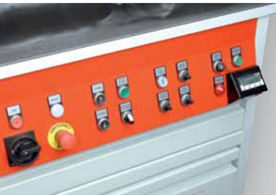
Convenient panel (digital display available as option)

Broken cutters and drills are as easily cut-off as carbide blanks, HSS knives, tempered guides, tungsten electrodes, ceramic balls, glass rods and fiberglass tubes. There are almost no limits to the use of the TM 374!