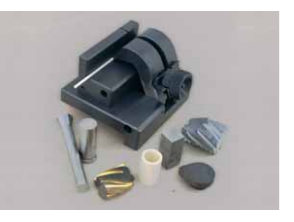
Three point clamping device for 3 – 50 mm