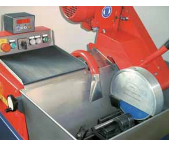
UFT 210 – the machine for cutting-off and facing

When using the UFT 370 , the work piece is always completely immersed which allows a maximum cooling of the grinding point through the disc rotation. Therefore the work piece and the disc have an optimal cooling and cleaning.